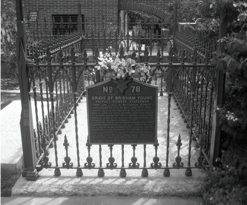
The grave site of President Brigham Young is located just east of Temple Square in Salt Lake City.

hesitates for a few moments. Below is a chart showing the final resting places of each latter-day prophet buried, along with coordinates to locate their grave sites.