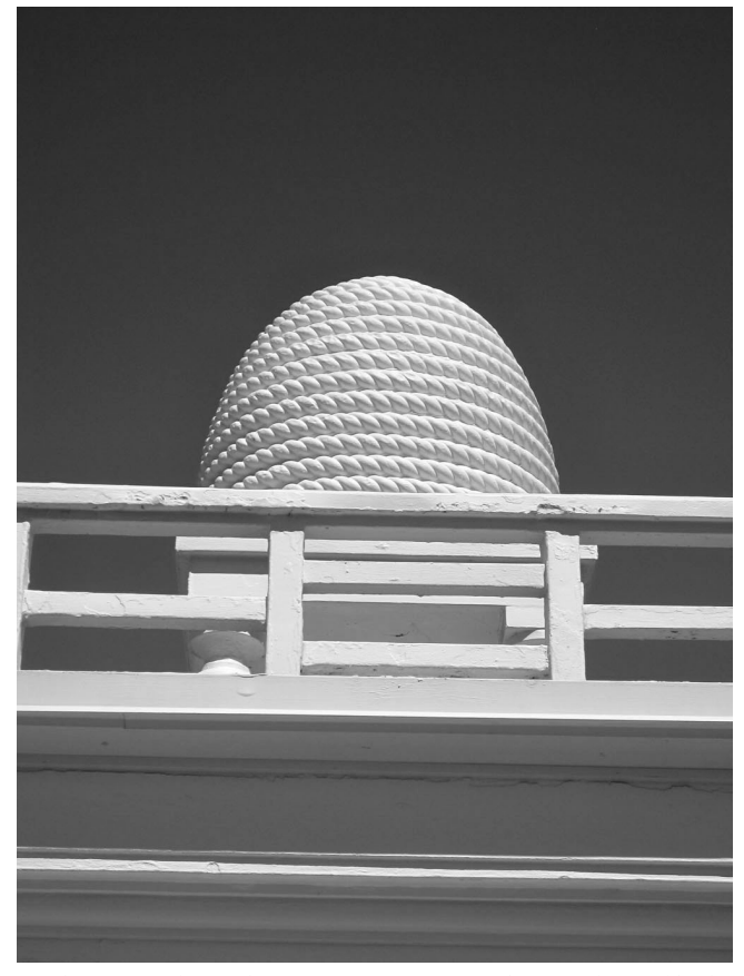
Beehive atop the Beehive House.

it encompassed."<sup>32</sup> The beehive stands alone as the symbol of Utah. It symbolizes industry and unity in strength, but little more. To the thoughtful observer, the link between the beehive and deseret still holds meaning. It is a visual reminder that an ancient people originating from the Tower of Babel roamed this land. It is a reminder that the Book of Mormon influence reaches from the sidewalks, with their honeycomb patterns, to the heavens, with beehives atop the Joseph Smith Memorial Building and the Beehive House. From top to bottom, the city of the Great Salt Lake is an expression of Book of Mormon