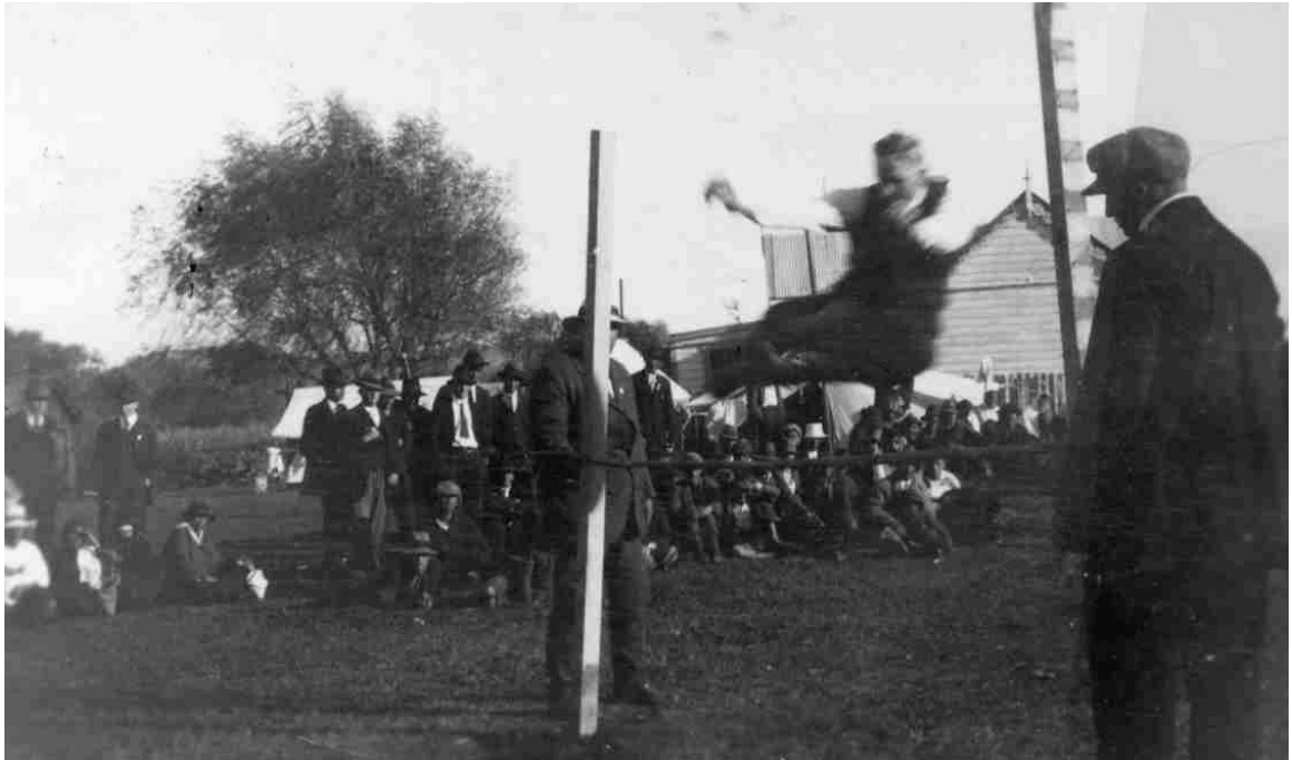
Fig. 2. David O. McKay high-jumping at the 1921 New Zealand Hui Tau

Until that moment I had not given much serious thought to the gift of tongues, but on that occasion, I wished with all my heart that I might be worthy of that divine power.