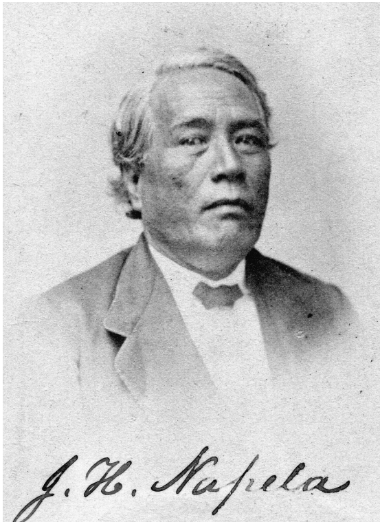
Fig. 2. Jonathan Nāpela in 1869

It is obvious that even before their collaboration on the translation, Cannon had won Nāpela’s gratitude and respect. It is inconceivable